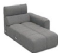
CH00R 104 cm x 99 cm x 166 cm 47 kg / 1 pcs