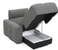
CH00LC 104 cm x 99 cm x 166 cm 62 kg / 1 pcs