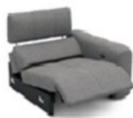
B150ER 104 cm x 99 cm x 99 cm 53 kg / 1 pcs