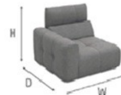
Dimensions W x H x D kg net / pcs