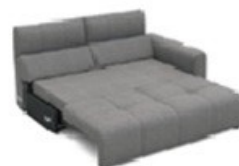
FB300LR 181 cm x 99 cm x 99 cm 85 kg / 1 pcs