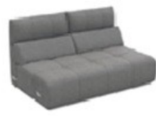
E300 160 cm x 99 cm x 99 cm 41 kg / 2 pcs