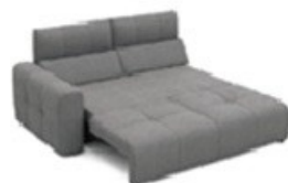
FB300LL 181 cm x 99 cm x 99 cm 85 kg / 1 pcs