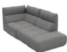
T02R 100 cm x 99 cm x 217 cm 63 kg / 1 pcs