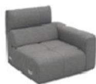
B150R 104 cm x 99 cm x 99 cm 36 kg / 1 pcs