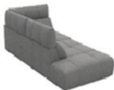
T02L 100 cm x 99 cm x 217 cm 63 kg / 1 pcs