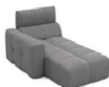
CH00L 104 cm x 99 cm x 166 cm 47 kg / 1 pcs