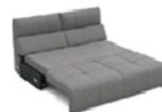
FE300L 160 cm x 99 cm x 99 cm 73 kg / 1 pcs