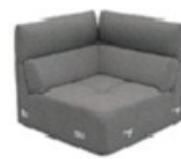
EK03 100 cm x 99 cm x 100 cm 36 kg / 1 pcs