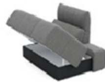
IS00RC 100 cm x 99 cm x 117 cm 40 kg / 1 pcs