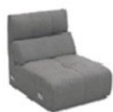
E150 80 cm x 99 cm x 99 cm 24 kg / 1 pcs