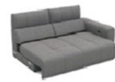
B300RR 181 cm x 99 cm x 99 cm 59 kg / 1 pcs