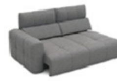
B300RL 181 cm x 99 cm x 99 cm 59 kg / 1 pcs