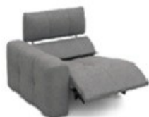
B150EL 104 cm x 99 cm x 99 cm 53 kg / 1 pcs