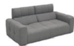
C300 206 cm x 99 cm x 99 cm 65 kg / 1 pcs