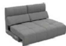
E300R 160 cm x 99 cm x 99 cm 47 kg / 1 pcs