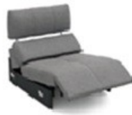
E150EL 80 cm x 99 cm x 99 cm 41 kg / 1 pcs