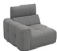
B150L 104 cm x 99 cm x 99 cm 36 kg / 1 pcs