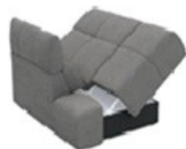
IS00LC 100 cm x 99 cm x 117 cm 40 kg / 1 pcs