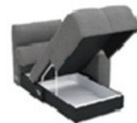
CH00RC 104 cm x 99 cm x 166 cm 62 kg / 1 pcs